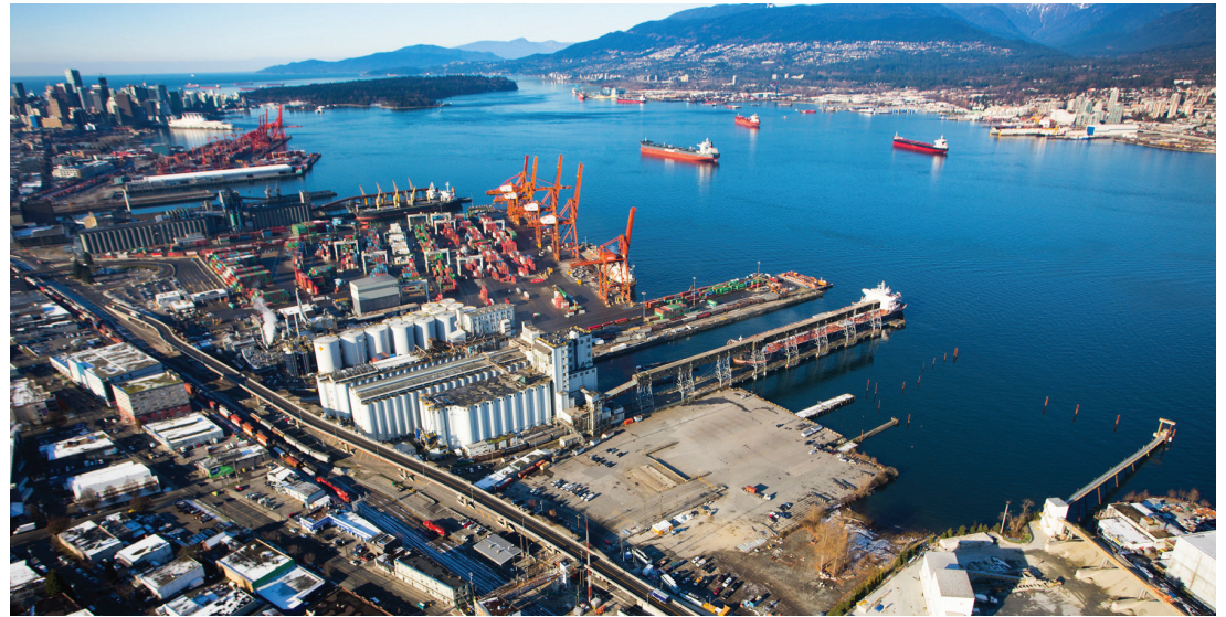
Key import and export entryways halted as blockades continue | VANCOUVER FRASER PORT AUTHORITY

affect communities across Canada and virtually every sector of our economy. Perishable goods including food and consumer items, Canadian grain and agriculture products, de-icing fluid at airports, construction materials, natural resources creating rural jobs across Canada such as lumber, aluminum, and propane are examples of products shipped by rail.