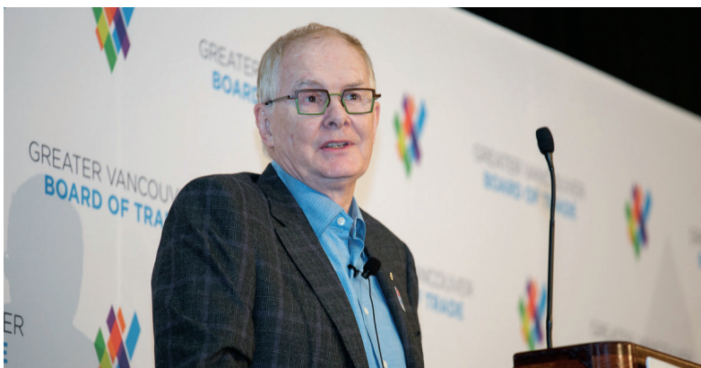
On Feb. 20 we had John Furlong, CEO of the Vancouver 2010 Olympic & Paralympic Winter Games reflect on the 10-year anniversary of the Olympics. He also planted the seed to a potential 2030 bid