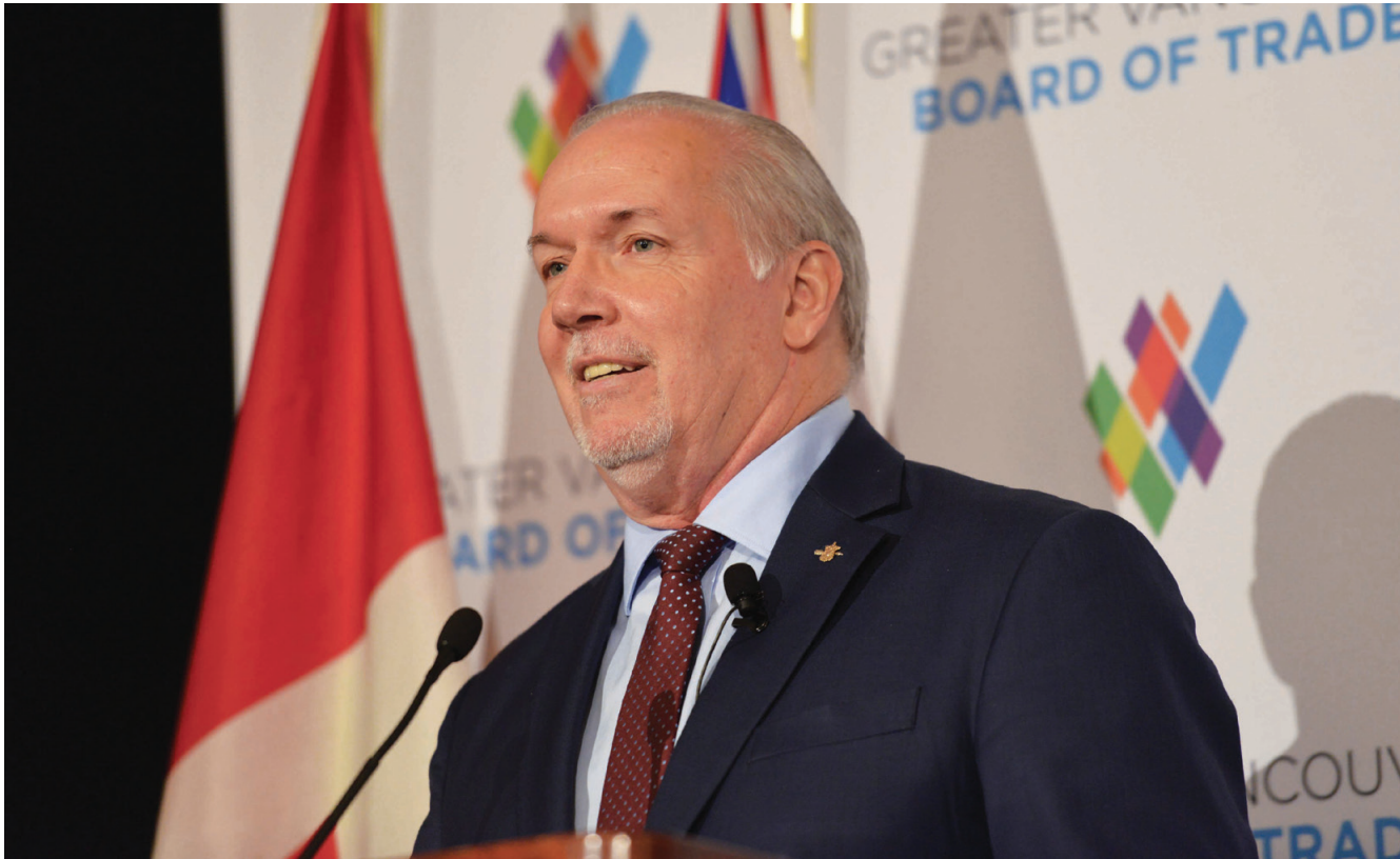
Premier John Horgan provided a recap of B.C. Budget 2020 at the Greater Vancouver Board of Trade on Feb. 21, three days after the budget was unveiled in Victoria. The Premier discussed the key issues and opportunities impacting the region's business community, including expansion of the tech sector, affordability, talent recruitment and retention, tax competitiveness, and child care