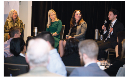
Thrive Series: Hiring and firing for small businesses, hosted by the Small Business Council on Feb. 12 and provided important information on implementing a smart HR strategy