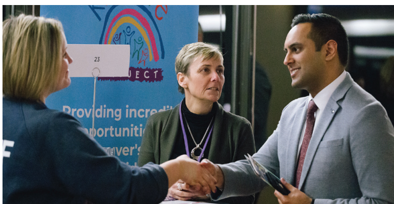
At the Company of Young Professionals' (CYP) third annual Night of Non-Profit Engagement on Feb. 4, CYP Members had the opportunity to uncover their ideal volunteer opportunity

Did you know the Greater Vancouver Board of Trade hosts more than 100 speaker events, seminars, and networking receptions each year?