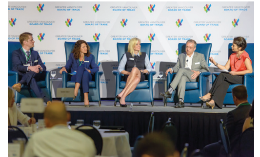
Industry and planning experts take part in one of three sessions at Housing Forum 2018, focusing on 'Getting to Yes: Policies and Barriers to Increasing Housing Supply.'