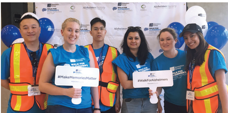
Members of the Board of Trade's under-35 program, the Company of Young Professionals, volunteered at the annual Walk For Alzheimer's on May 6. Learn more about the program and how to get involved at boardoftrade.com/cyp .

Did you know the Greater Vancouver Board of Trade hosts over 100 speaker events, seminars and networking receptions each year?