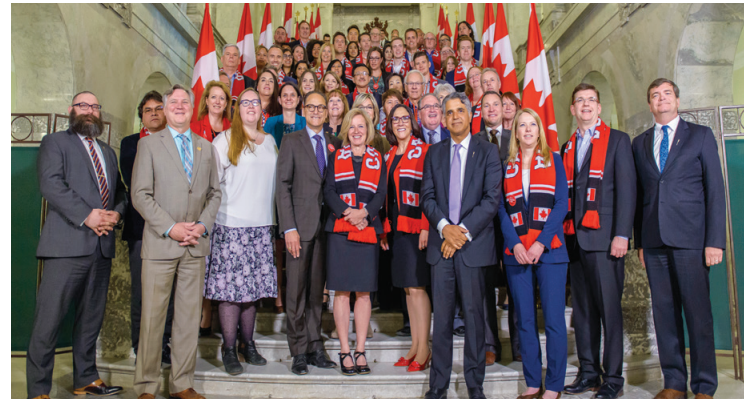
Federation Flight delegates are greeted on the steps of the Alberta legislature by Premier Rachel Notley on May 17, 2018.

For photos from the trip, visit facebook.com/boardoftrade .