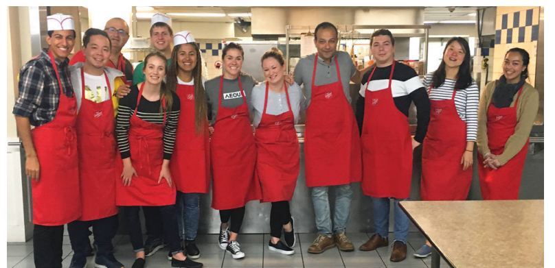
Members of the Greater Vancouver Board of Trade's under-35 program, the Company of Young Professionals, served dinner at the Salvation Army Harbour Light on Oct. 20. Learn how you can get involved at boardoftrade.com/cyp .

Did you know the Greater Vancouver Board of Trade hosts nearly 130 speaker events, seminars, webinars, and networking receptions each year?