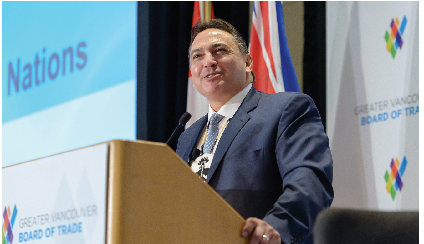
Perry Bellegarde, National Chief of the Assembly of First Nations, returned to Vancouver on Nov. 23 for his fourth annual address to the Greater Vancouver Board of Trade. In his remarks, National Chief Bellegarde identified his top priorities for his second term at the helm of the AFN and discussed the role that B.C. businesses can play in reconciliation, including partnerships with First Nations communities that create jobs and economic opportunities. Listen to the full remarks at boardoftrade.com/afn2018.