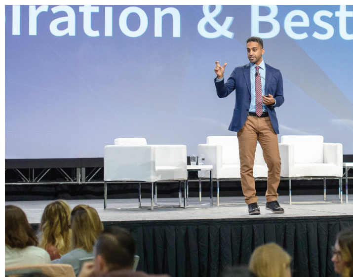
Wyle Baoween presents at WE FOR SHE 2018 on Nov. 16.

Data helps build a strong evidence-based analysis to highlight the issues. This leaves little