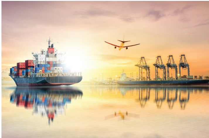
GVBOT's inaugural Trade Forum is set to take flight on Oct. 27.

The morning will kick off with a panel discussion entitled "The future of trade in North America." Nearly one year into Donald Trump's presidency, this