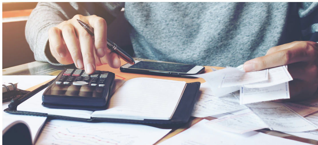
Help us tell Ottawa to 'hit the pause button' on small business tax changes! Visit boardoftrade.com/taxchanges .

In late August, our organization launched a new campaign calling