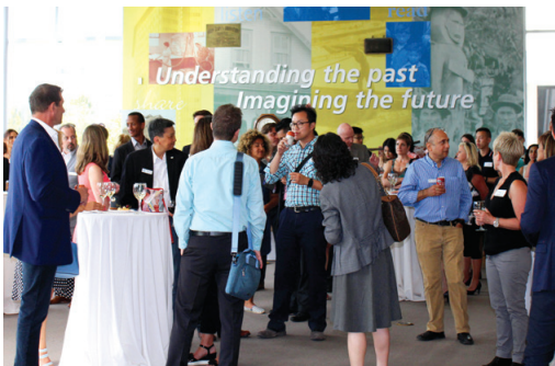
GVBOT Members had a chance to explore the Museum of Vancouver after hours during a special networking reception on July 12.