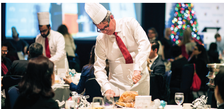
Guests carve their turkeys at GVBOT's 2016 Holiday Lunch, held Dec. 1 at the Hyatt Regency Vancouver. This annual tradition includes a festive meal with all the trimmings, live entertainment, and a media panel.