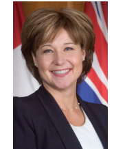
Hon. Christy Clark Premier, Province of British Columbia