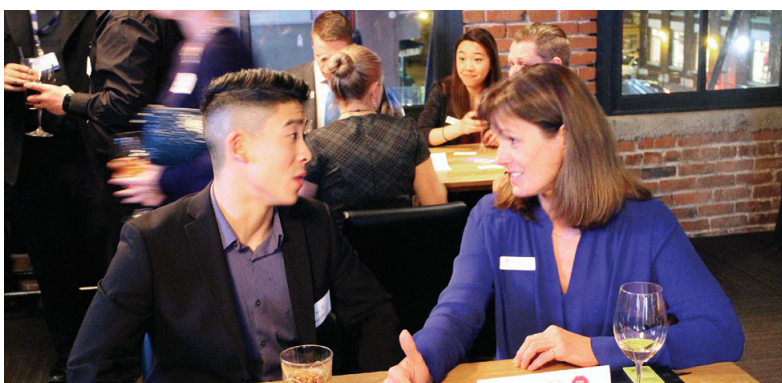
Students and mentors in the Leaders of Tomorrow program take part in the annual Speed Networking Night event, held Jan. 10 at The Loft at Earl's. Learn more about our mentorship program at boardoftrade.com/lot.