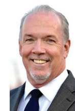
John Horgan Leader, BC NDP